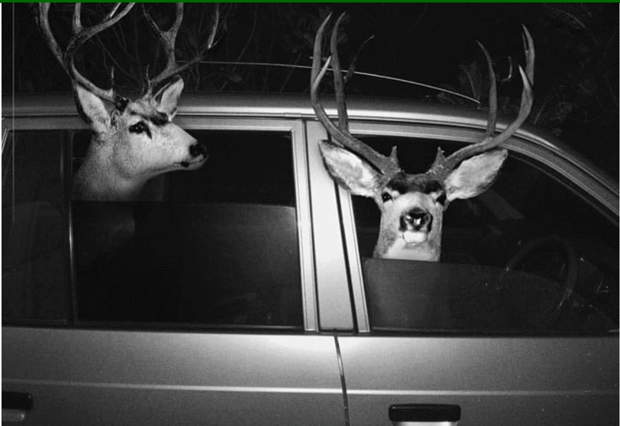
Two deer sitting in a parked car waiting for the valet. Click here to go to image.