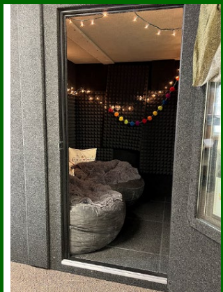
Above shows Fortress of Solitude, a place to rest.