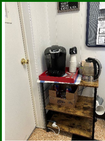
Above shows coffee and tea available

Drop by for a snack, a quiet place to rest, do homework, or to talk about your ideas. All are welcome.