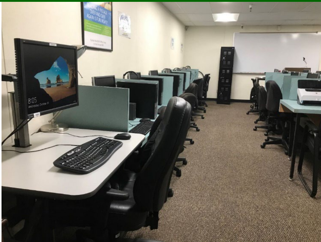
Above photo is of the left side of the DSPS lab, featuring ergonomically designed chairs, desks, and keyboard