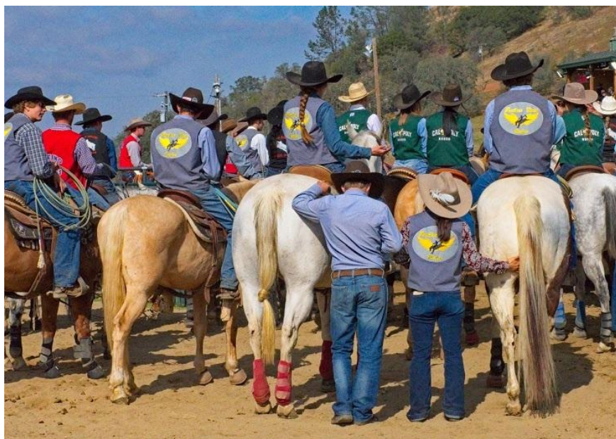
Above photo taken by Nikki Saurman shows community Feather River Rodeo Athletes

With weeks and even months of preparation, you will find each Feather River Rodeo student working hard at the fairgrounds to clean up the facility and put together a beautiful arena and ground for our equine and human athletes to perform in.